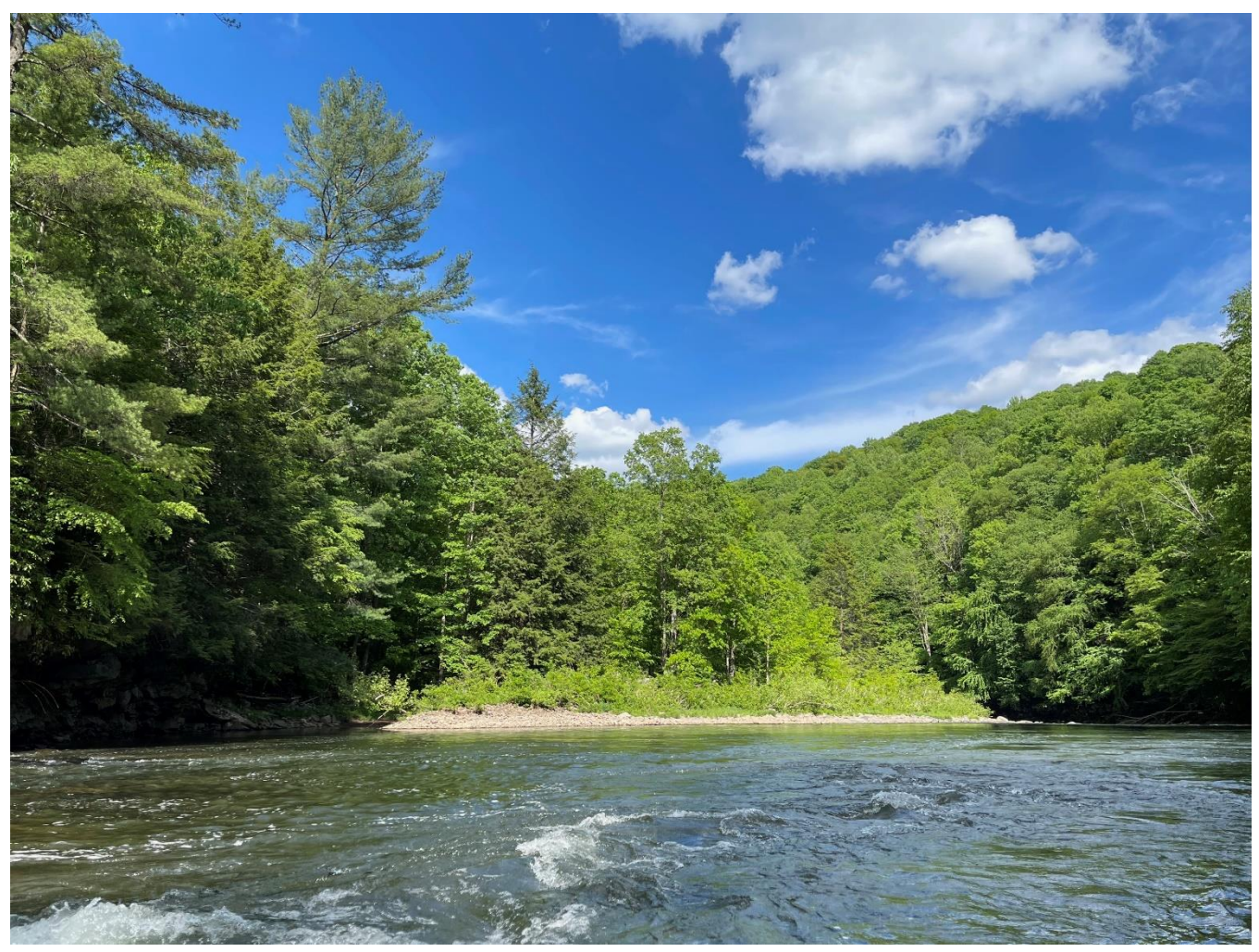
A stretch of the Youghiogheny River near Friendsville.